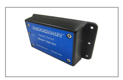
Revguard speed switch (1520-001)